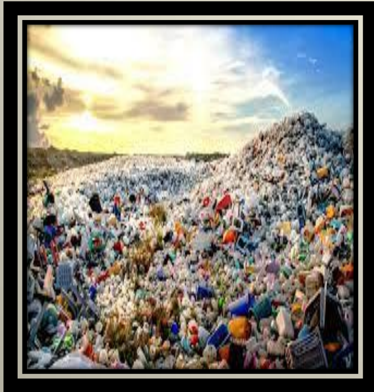
PLASTIC- A BOON OR BANE?