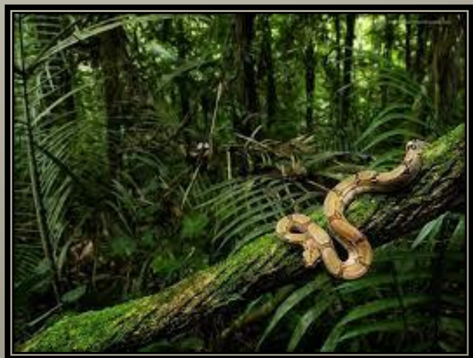
HABITATS MY HOME MY SHELTER