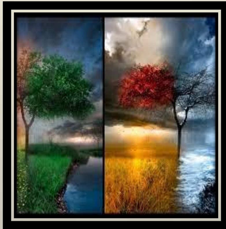
A JOURNEY FROM SPRING TO WINTER