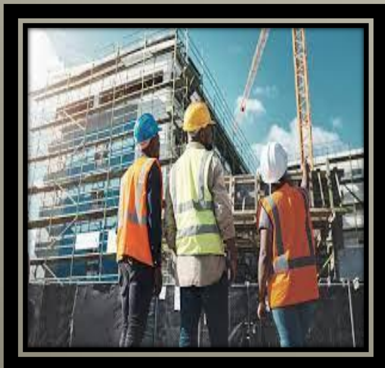
CONSTRUCTION OF A BUILDING